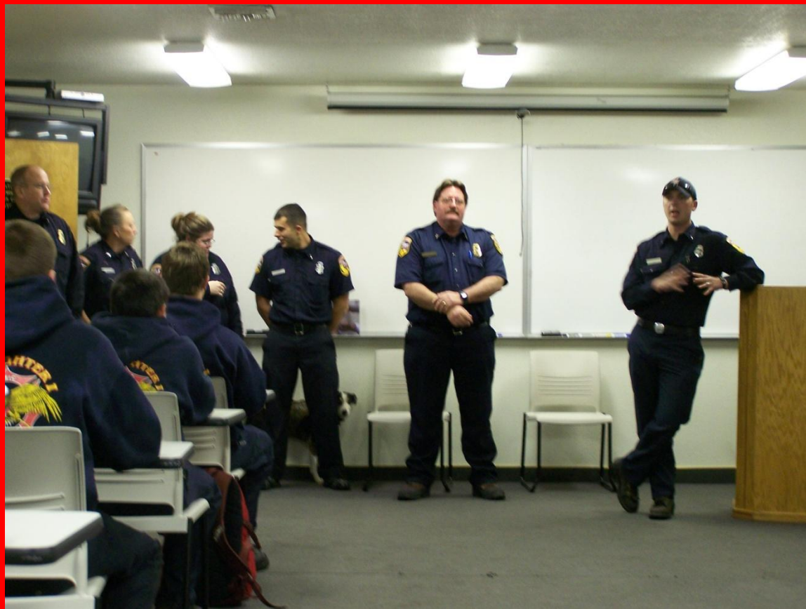
CALFIRE CREW ADDRESSING CLASS